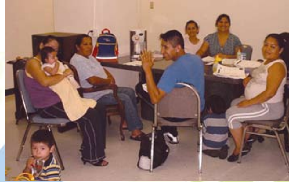
◀ The Spanish Bible study is growing on Thursday mornings!