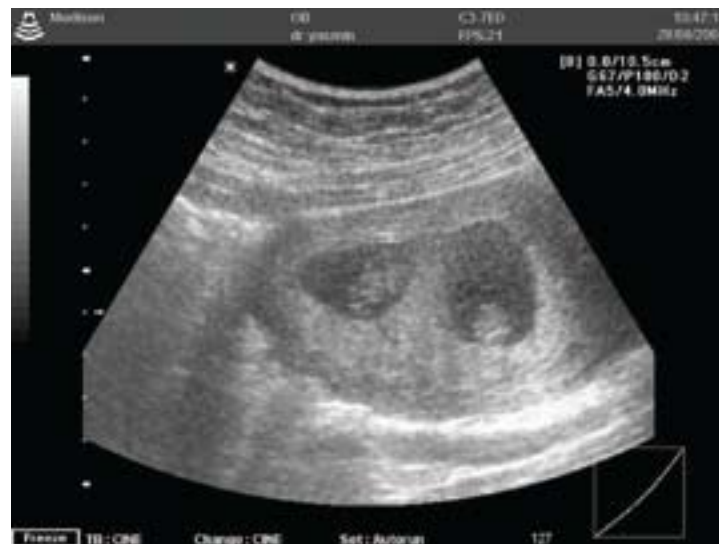
▲ Sonogram of twins early in first trimester.

God has been faithful to “bestow on them a crown of beauty instead of